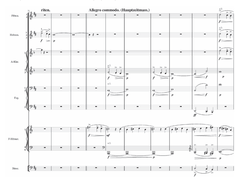
Example 8. Gustav Mahler, Fifth Symphony, Rondo-Finale, mm. 24-39

nightingale, it only confuses me! From the start, the Finale announces that it will search for an answer to the problems raised in Part 1 of the symphony not in some transcendent realm, but right here on earth, and that down-toearth it will stay. The heavily accented downbeat beginning of the theme itself with its background of an open-fifth pedal point plunge us on the spot into the giocoso rustic ambience of a classical symphonic finale (see Example 8).