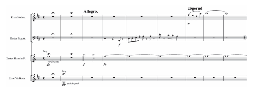
Example 7. Gustav Mahler, Fifth Symphony, 5. Rondo-Finale, mm. 1-6

nightingale, it only confuses me! From the start, the Finale announces that it will search for an answer to the problems raised in Part 1 of the symphony not in some transcendent realm, but right here on earth, and that down-toearth it will stay. The heavily accented downbeat beginning of the theme itself with its background of an open-fifth pedal point plunge us on the spot into the giocoso rustic ambience of a classical symphonic finale (see Example 8).